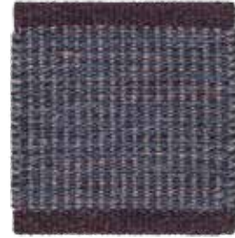
Dark Lavender 220