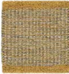
Golden Ash 450