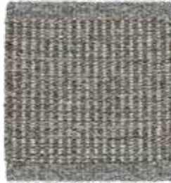
Silver Willow 551