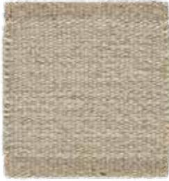
Sand Dune 882