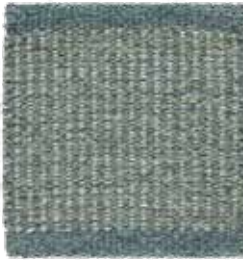
Ocean Mist 221