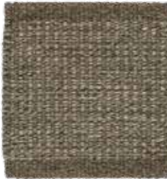
Pine Tree 880