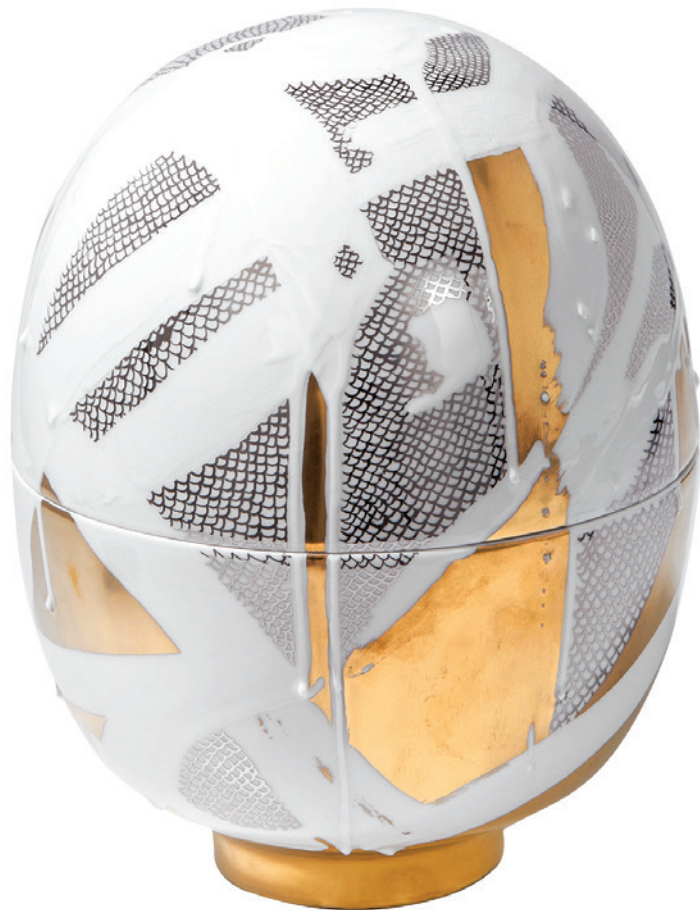
Left: Egg Vessel Gold and Platinum 2018