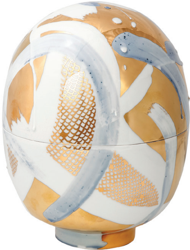
Left: Egg Vessel Gold and Blue 2018