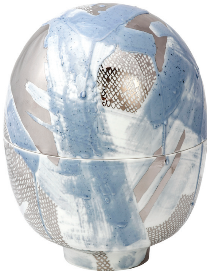
Right: Egg Vessel Blue and Platinum 2018